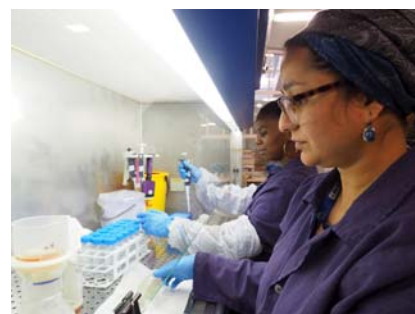
ICGEB laboratories in Trieste, New Delhi and Cape Town

In addition, the ICGEB offers the opportunity to establish Regional Research Centres (RRCs) to contribute to strengthen research skills, knowledge and capacities of the local scientific community while pursuing specific objectives for research, training and technology transfer to industry to benefit both the