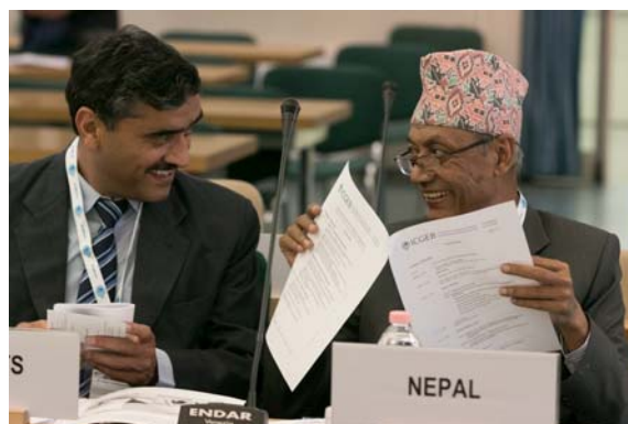
22nd Session of the Board of Governors, Trieste, Italy

The rate of the annual assessment of membership is directly linked to the UN rate, corrected by a multiplier of 0.75; the minimum level of contribution is US$5000 and the maximum level of contribution is US$150,000.