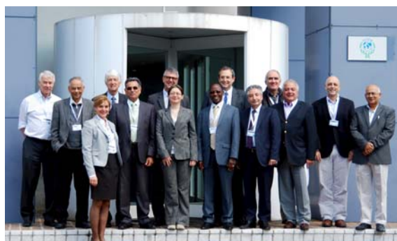
2016 CSA members, Trieste, Italy